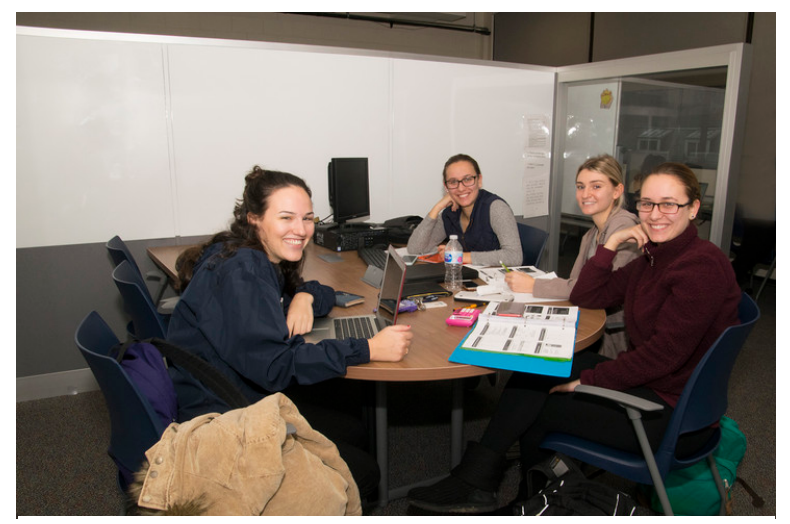
Pods feature writable walls and plenty of ports and privacy for Abington students to successfully collaborate.

"Students particularly like them and the ability to extensively use whiteboards and other white surfaces to share their work," she said.