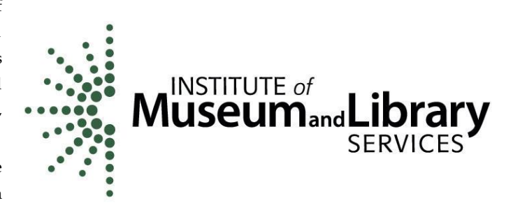
Institute of Museum and Library Services logo

The ULS, in partnership with the Carnegie Library of Pittsburgh, the Western Pennsylvania Regional Data Center, and the Urban Institute, which supports and coordinates the National Neighborhood Indicators Partnership, will develop the capacity of public